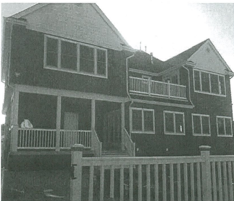
113 Englewood Avenue, Rear