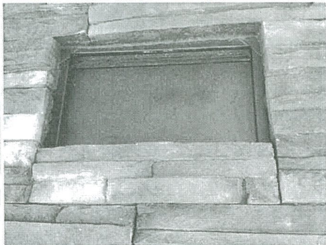
USA Flood Vent