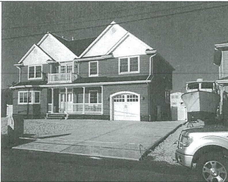
113 Englewood Avenue, Front

If using the Elevation Certificate to obtain NFIP flood insurance, affix at least 2 building photographs below according to the instructions for Item A6. Identify all photographs with date taken; "Front View" and "Rear View"; and, if required, "Right Side View" and "Left Side View." When applicable, photographs must show the foundation with representative examples of the flood openings or vents, as indicated in Section A8. If submitting more photographs than will fit on this page, use the Continuation Page.